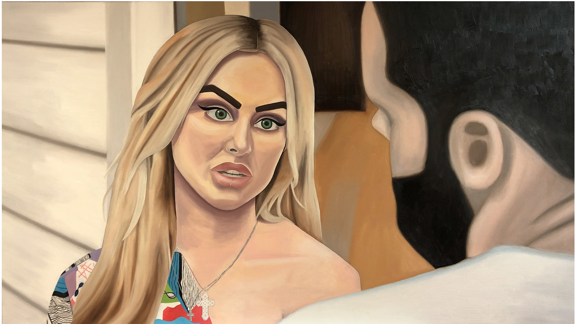
Oil on Canvas | 64" x 36"