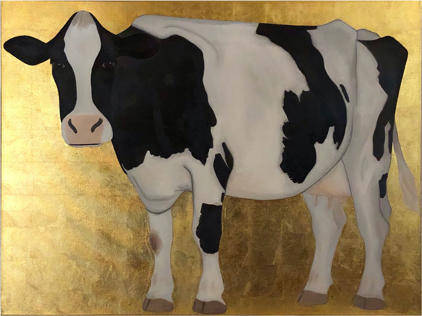
Oil and Gold Leaf on Canvas | 40" x 30"