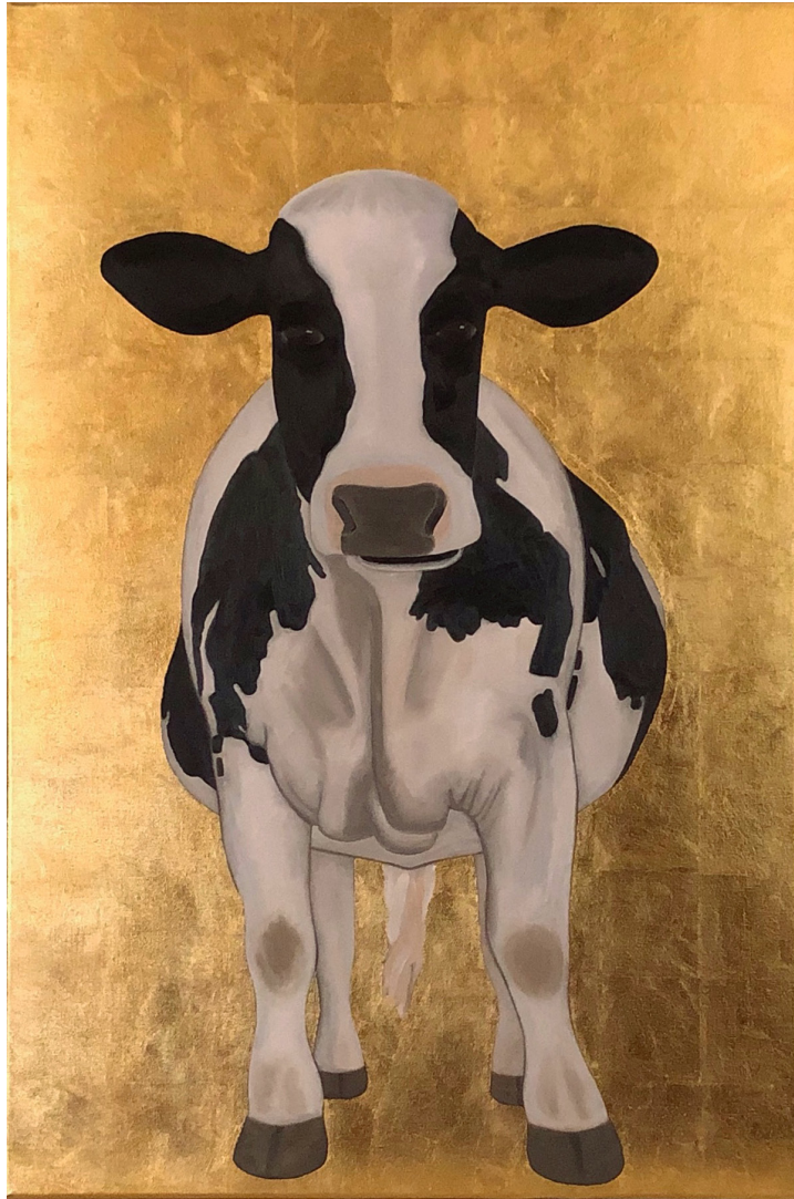
Oil and Gold Leaf on Canvas | 24" x 36"