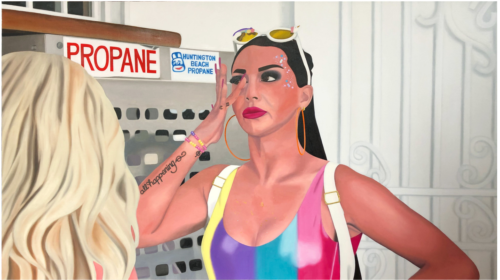
Oil on Canvas | 64" x 36"