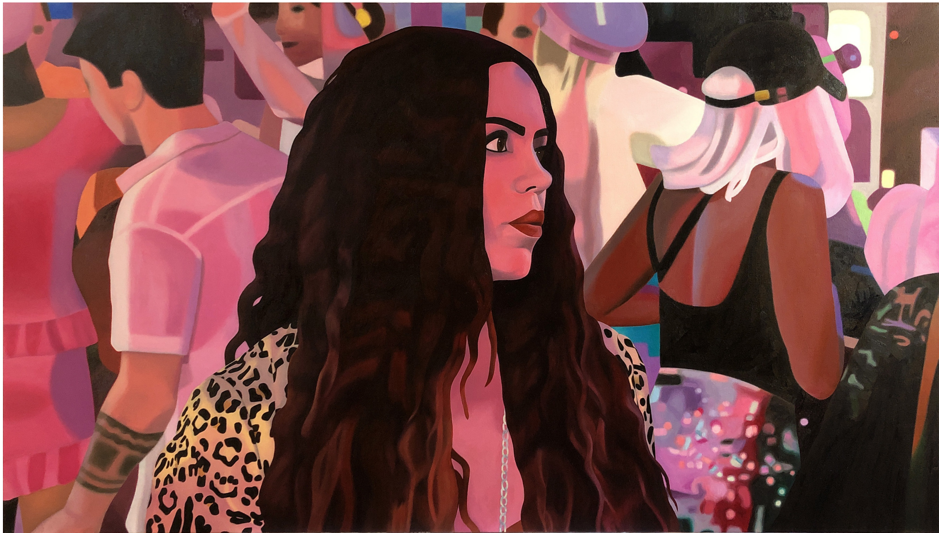
Oil on Canvas | 64" x 36"