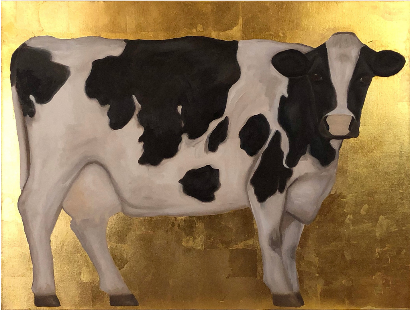
Oil and Gold Leaf on Canvas | 40" x 30"