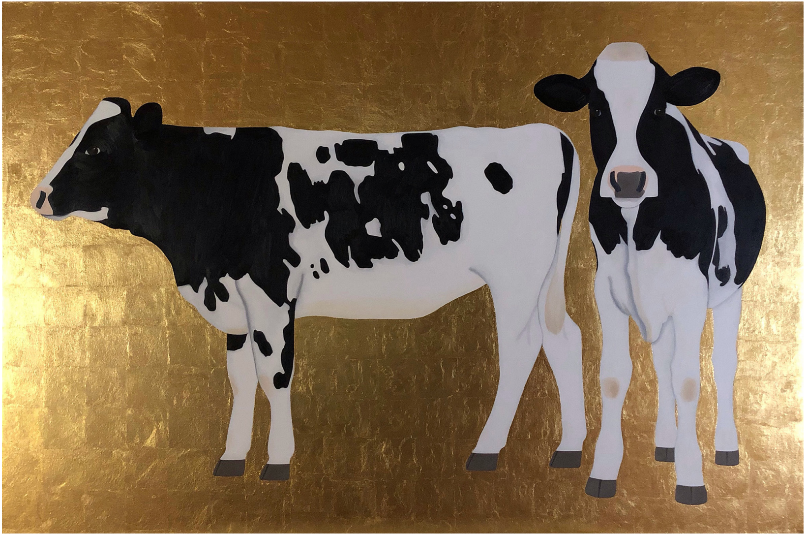
Oil and Gold Leaf on Canvas | 60" x 40"