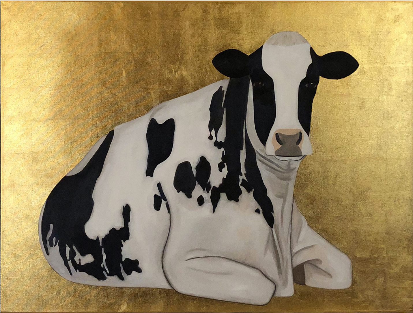
Oil and Gold Leaf on Canvas | 40" x 30"