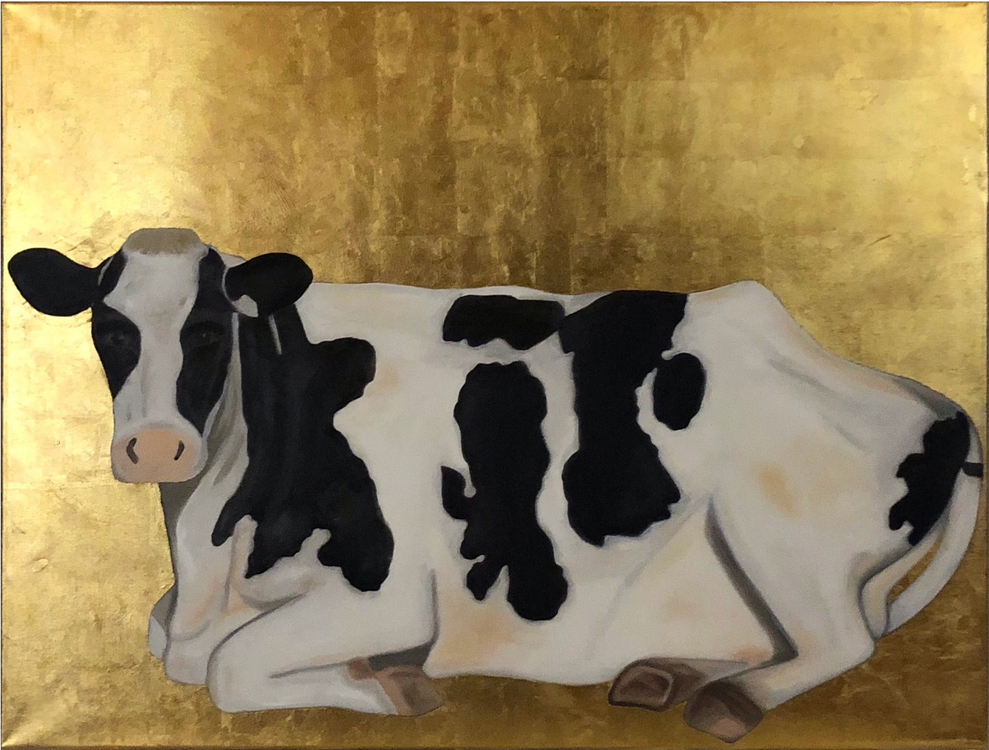
Oil and Gold Leaf on Canvas | 40" x 30"