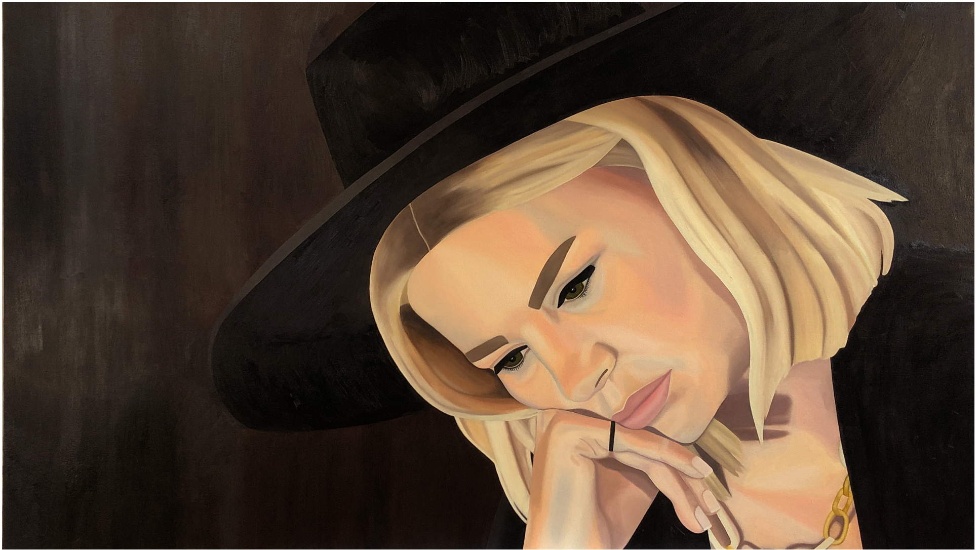
Oil on Canvas | 64" x 36"