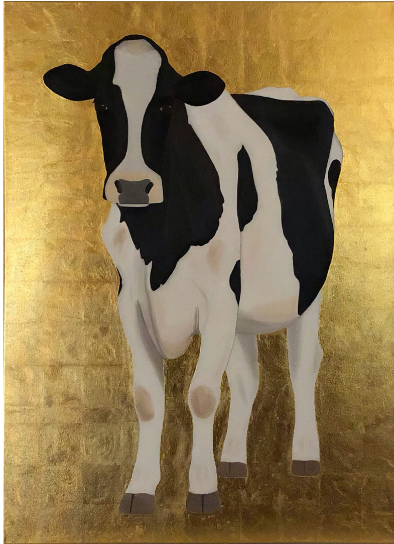
Oil and Gold Leaf on Canvas | 30" x 40"