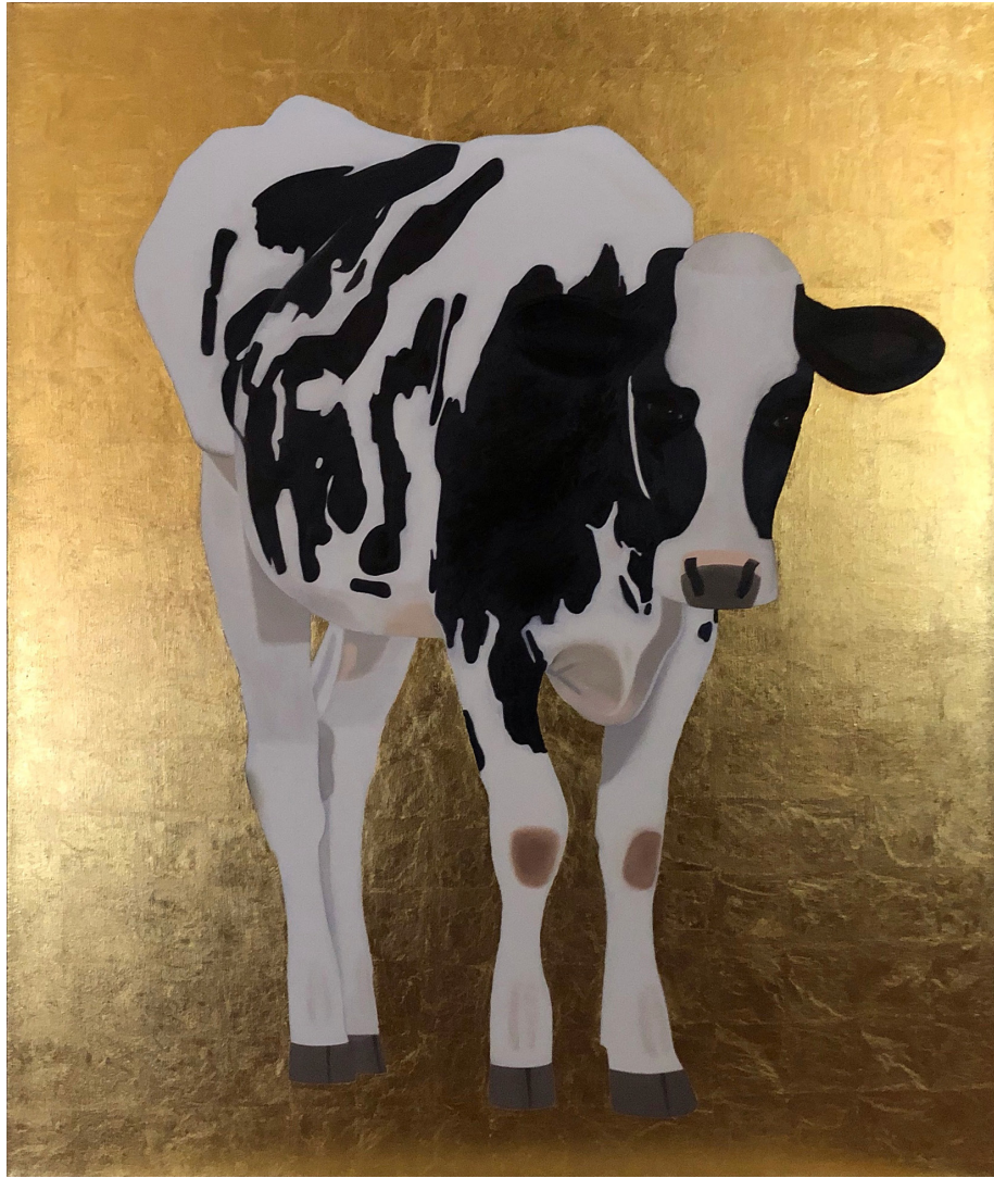
Oil and Gold Leaf on Canvas | 41" x 49"