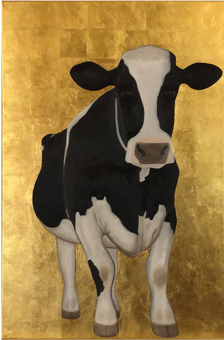
Oil and Gold Leaf on Canvas | 24" x 36"