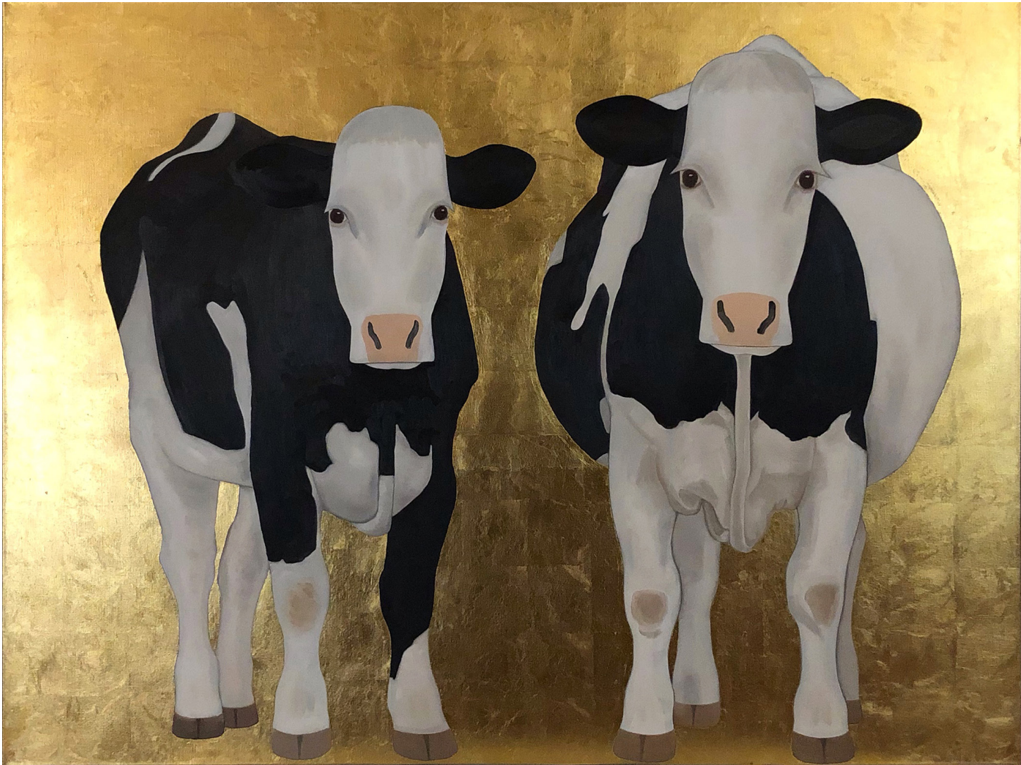
Oil and Gold Leaf on Canvas | 48" x 36"