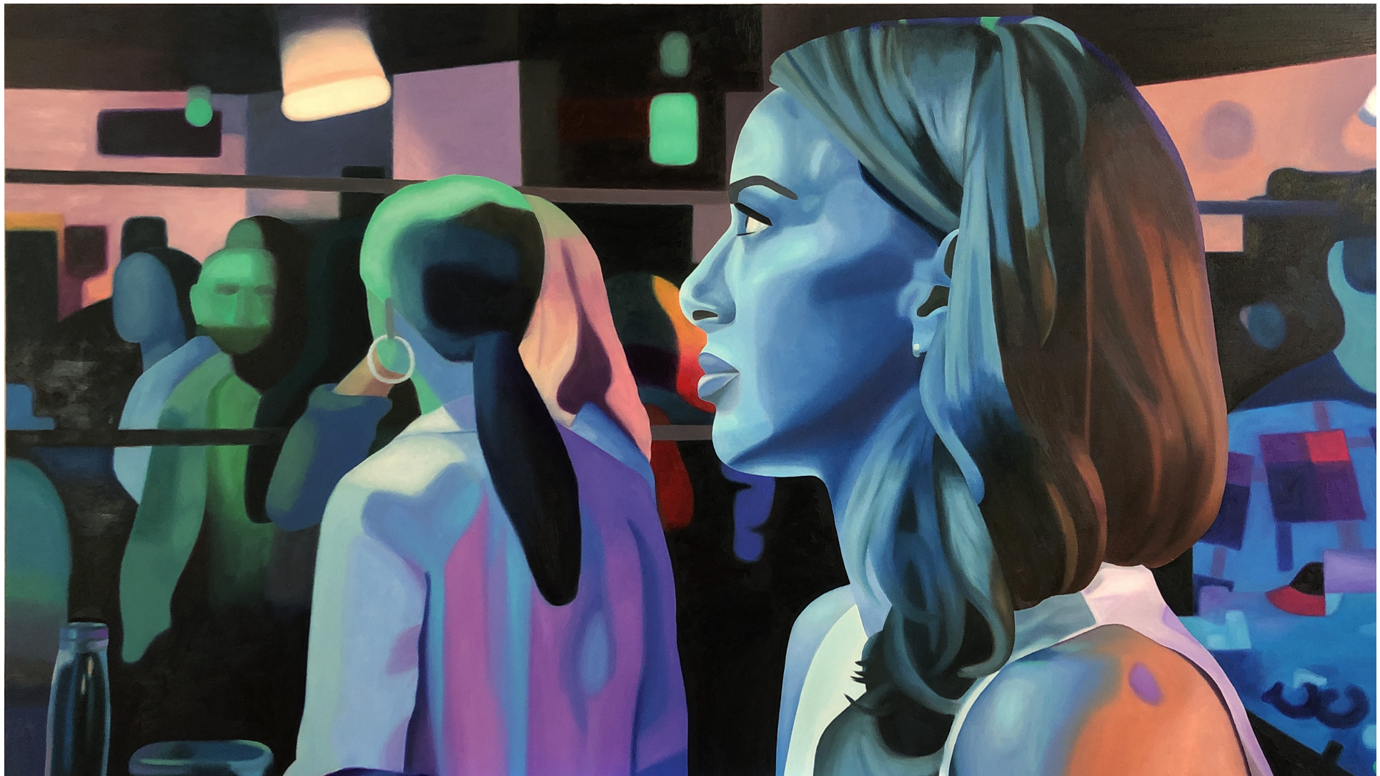
Oil on Canvas | 64" x 36"